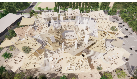
International Center Station Northern Area Complex (Sendai) Scheduled for completion in 2031 Miyagi, Japan © Sou Fujimoto Architects

The exhibition presents a large model of the multi-purpose complex center to be built in the city of Sendai, Japan that will house music halls and serve as the 2011 earthquake memorial (scheduled to be completed and opened in fiscal 2031). The design competition for the project held in 2024 selected Fujimoto’s proposal, which had as its theme “Many reverberations/One reverberation.” This is the embodiment of Fujimoto’s concept of the “Open Circle,” involving unity with diversity, diverse things reverberating with one another, as well as drawing together and spreading out. The entire project is presented, including materials that explain the process involved in going from design to proposal.