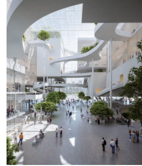
Shenzhen Museum (Shenzhen Reform and Opening-up Exhibition Hall)

With his Aomori Museum of Art design competition proposal submitted in 2000, the then-unknown Fujimoto won high praise from the likes of architect Toyo Ito. He was awarded second place, suddenly thrusting him onto the architectural scene. He went on to design a series of prominent projects, including the Musashino Art University Museum & Library , featuring bookshelves aligned in a spiral pattern based on the concept of a forest of books, the Serpentine Gallery Pavilion 2013 , consisting of white steel poles assembled into a three-dimensional, latticed structure, the L’Arbre Blanc (The White Tree), a housing complex featuring large balconies resembling leaves spreading out from a tree, and House of Music, Hungary , a music-focused cultural complex that blends in with the greenery of a park, blurring the lines between nature and architecture. He is currently working on a number of projects, including Expo 2025 Osaka, Kansai, Japan, the International Center Station Northern Area Complex in Sendai, Japan (scheduled for completion in 2031), and providing designs for mixed-use urban developments in Europe. This survey show offers an overview of his architectural journey over the past quarter century, covering everything from work in his early years to projects currently underway.