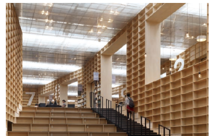
Musashino Art University Museum & Library

Scheduled for completion in 2026 Fukuoka, Japan