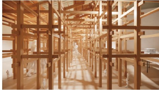
Model of the Grand Ring, Expo 2025 Osaka, Kansai, Japan (rendering of the installation) © Sou Fujimoto Architects