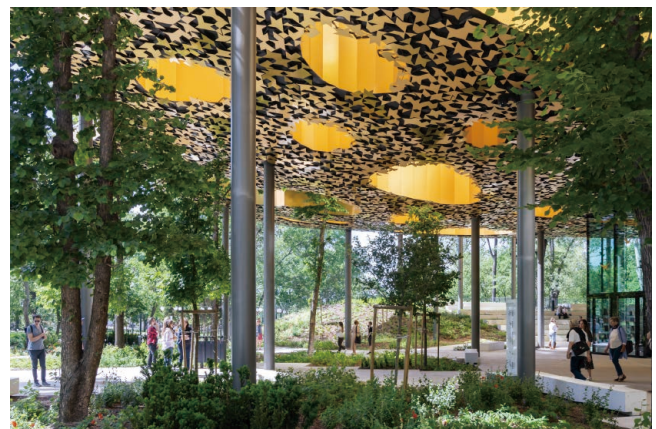
House of Music, Hungary (interior) 2021 Budapest