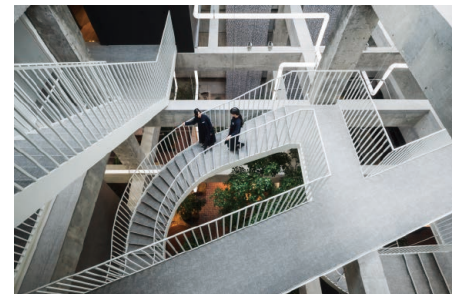
Shiroiya Hotel 2020 Gunma, Japan