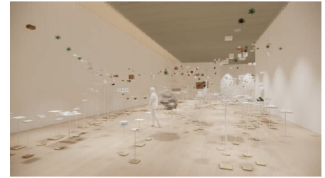
The Forest of Models (rendering of the installation) © Sou Fujimoto Architects

The Forest of Models installation presents all of Fujimoto's projects, from work in his early years to projects currently being planned. In a large space of over 300 square meters, countless items are arrayed chronologically, including models, materials, and objects that are fragments of ideas, represented as one "forest." The forest shows the process by which projects develop, with one leading to another, providing an overall picture of Fujimoto's architectural work.