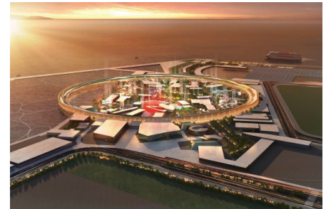
Expo 2025 Osaka, Kansai, Japan Scheduled for completion in 2025 © Sou Fujimoto Architects, © TOHATA ARCHITECTS & ENGINEERS

The show presents the Grand Roof (Ring) project that has become the symbol of Expo 2025 Osaka, Kansai, Japan. Fujimoto is serving as the design producer for the Expo. This exhibition zeros in on the Ring concept from a variety of perspectives throughout the galleries, including the 1:5 model of part of the Ring, photographic records of its exterior, project materials ranging from the Ring's original conception to its completion, and a model of the Ring included in the large The Forest of Models installation.