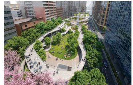
Meiji Park Management and Operations