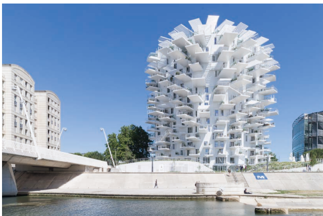
L'Arbre Blanc (The White Tree) 2019 Montpellier, France

Architecture and cities today are being called on to play a bigger role than before when it comes to issues such as the ecology and environment, continually changing human relationships, the need to bring together divided communities, and how our lives are affected by technological developments. We welcome visitors to join us as we take Fujimoto's practice as the context for considering how architecture could change our lives in times like these.