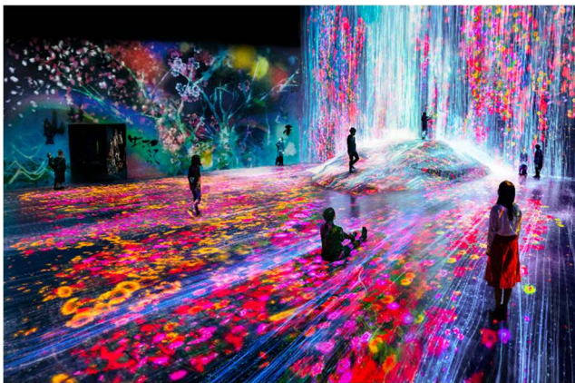
MORI Building DIGITAL ART MUSEUM: EPSON teamLab Borderless ©teamLab

Through such a group of works, teamLab Borderless is one borderless world without boundaries. Visitors can additionally immerse themselves in the borderless art to "wander, explore, discover in one borderless world." The new EPSON teamLab Borderless in Azabudai Hills will evolve, move, interact in complex ways, and forever change.