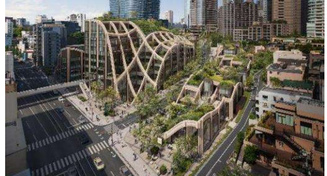
Azabudai Hills

Name: MORI Building DIGITAL ART MUSEUM: EPSON teamLab Borderless https://borderless.teamlab.art/jp/