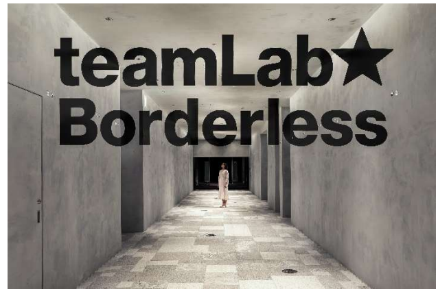
Museum entrance at MORI Building DIGITAL ART MUSEUM: EPSON teamLab Borderless, Azabudai Hills, Tokyo ©teamLab