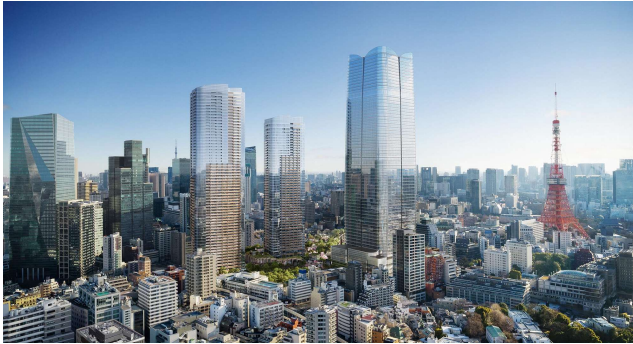
Azabudai Hills

Located adjacent to the ARK Hills complex, Azabudai Hills is midway between Roppongi Hills, the “Cultural Heart of Tokyo,” and Toranomon Hills, the “Global Business Center,” an area with both cultural and business personalities. Covering a vast area of 8.1-hectares, it is a lush urban oasis with 24,000m 2 of greenery, including a 6,000m 2 central square. The complex offers a total floor area of 861,700m 2 , including 214,500m 2 of office space, some 1,400 residential units and Mori JP Tower soaring to a height of 330 meters. This mixed-use complex can accommodate some 20,000 employees as well as 3,500 residents and is expected to welcome roughly 30 million visitors per year. Azabudai Hills is destined to become “a city within a city” as a “Hills of the future” project leveraging the learnings and experiences of previous Hills-series developments.