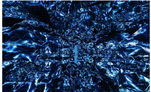
Black Waves- Megalith Crystal Formation (work in progress) ©teamLab

In Megalith Crystal Formation (work in progress) , the artworks without boundaries that create the world of teamLab Borderless move through the museum and into the room, creating one borderless world that connects in complex ways, eternally changing.