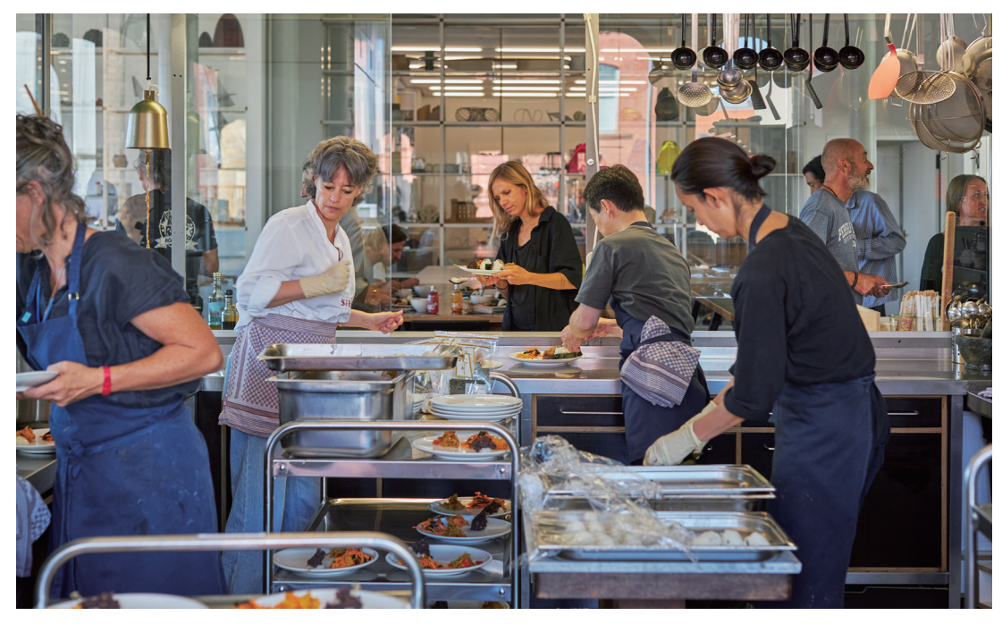
Lunch at Studio Olafur Eliasson Kitchen, 2023

https://www.tablecheck.com/shops/azabudai-hills-gallerycafe/reserve/