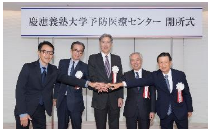
Opening Ceremony (October 4 th )