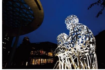
"Roots" Jaume Plensa 2014

Oval Plaza, 2F, Toranomom Hills Mori Tower