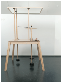
The endless study 2005 Installation view: Lunds Konsthall, Sweden, 2005

*Special tickets are available on first-come, first-served basis while supplies last.