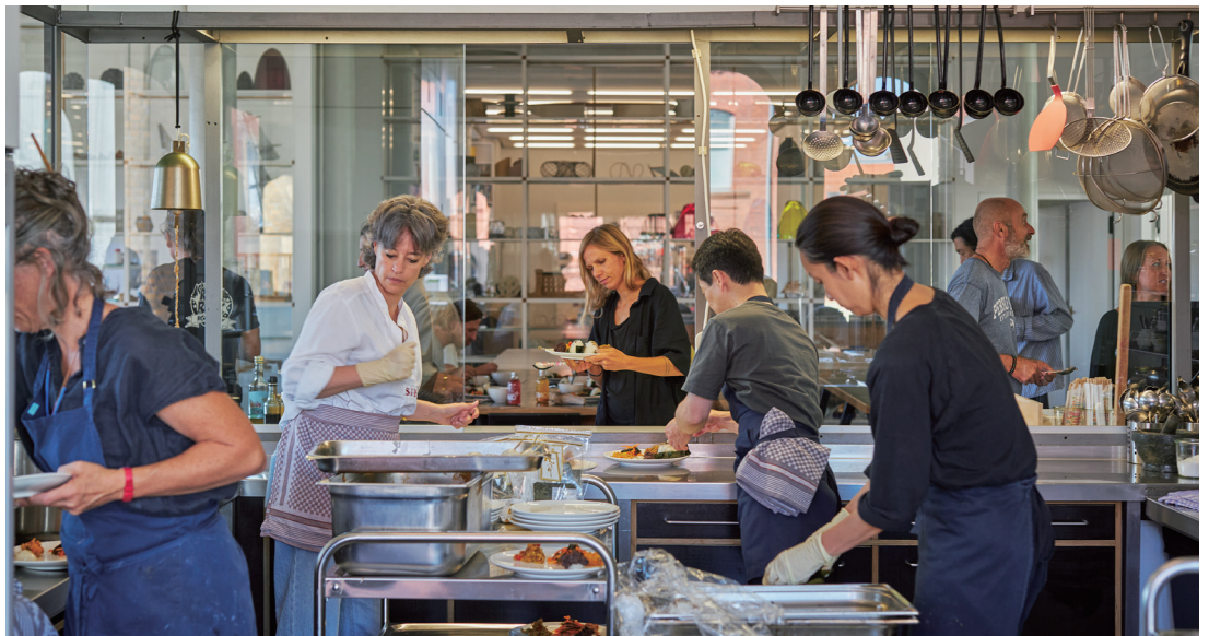
Lunch at Studio Olafur Eliasson Kitchen, 2023

As at SOE Kitchen, all menus can be adapted as vegan or vegetarian and will use organic ingredients as much as possible, which are healthy and kind to both humans and the planet. Furthermore, in line with SOE Kitchen's philosophy of “local production for local consumption,” all ingredients will be produced in Japan. They will also be sourced as much as possible from the Tokyo area, helping to minimize the CO2 emissions of transport. SOE Kitchen's efforts to address global issues through food are aligned with Eliasson's own approach to these issues in art. Please visit THE KITCHEN and experience the message of sustainability expressed through creations combining art and food. ※Eggs, dairy products, and honey are used in some menu items.