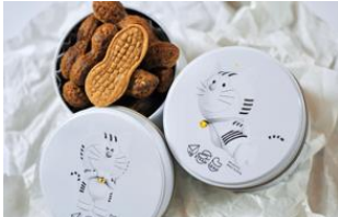
TORANOMON Peanut Butter Cookies (13 pieces) Price: 2,056 yen (excl. tax) Store: AM STRAM GRAM

AM STRAM GRAM's popular peanut butter cookies will be sold in a version featuring a flavor exclusive to Toranomom Hills. Two charmingly TORANOMON-designed tins each will have a tiger ( tora ) crest.