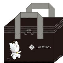
LAMMAS TORANOMON Cooler Bag Price: 1,182 yen (excl. tax) Store: LAMMAS/ISTINTO

This special collection of chocolates will be decorated with TORANOMON designed exclusively for Toranomom Hills. The one-of-a-kind assortment will be sold only at this area.