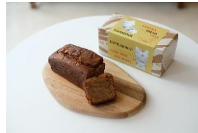
TORANOMON Banana Bread Price: 3,800 yen (excl. tax) Store: ovgo Baker BBB

AM STRAM GRAM's popular peanut butter cookies will be sold in a version featuring a flavor exclusive to Toranomom Hills. Two charmingly TORANOMON-designed tins each will have a tiger ( tora ) crest.