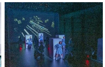
Rhizomatiks × ELEVENPLAY "border 2021"