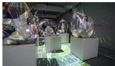
《Rhizomatiks × ELEVENPLAY "multiplex"》2021