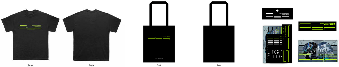
Over-sized T-shirt (black, M/L) JPY3,800

Sales locations: TOKYO NODE 45F, in front of GALLERY A, Toranomon Hills Cafe on Toranomon Hills Station Tower B2F