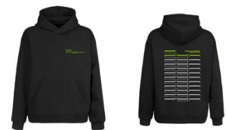
Original hoodies (M and LL sizes)