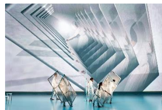
ELEVENPLAY×Rhizomatiks×Kyle McDonald "discrete figures"