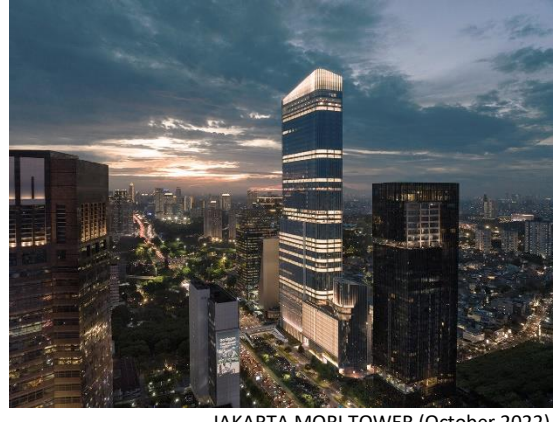
JAKARTA MORI TOWER (October 2022)

Another noticeable design feature is the tower's lighting scheme, which adopts a variety of techniques that create diverse expressions to enhance Jakarta's nightscape.