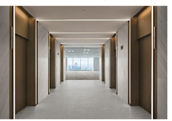
Elevator hall on the standard office floor