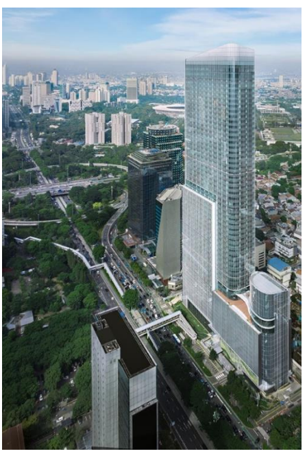
JAKARTA MORI TOWER (October 2022)

JAKARTA MORI TOWER, the capital city's newest landmark, was designed by Kohn Pedersen Fox Associates (KPF), the New York-based design firm that previously collaborated with Mori Building on Roppongi Hills Mori Tower in Tokyo and the Shanghai World Financial Center.