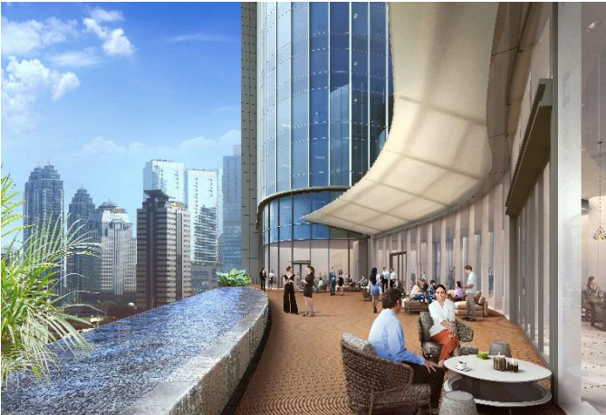
Restaurant floor (image)