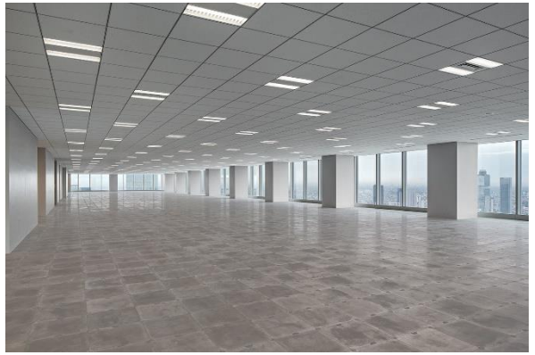
Standard office floor