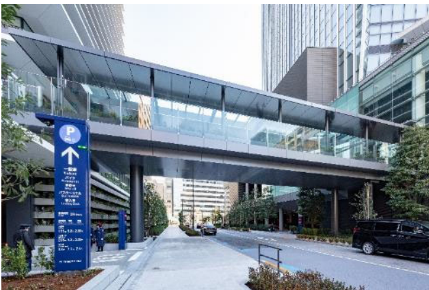
Pedestrian deck connecting Toranomon Hills Business Tower and Toranomon Hills Mori Tower

The 1,000 m 2 bus terminal on the first floor of Toranomon Hills Business Tower is directly accessible by walkways to Toranomon Hills Station (Hibiya Subway Line) and Toranomon Station (Ginza Subway Line). The terminal is a key departure/arrival point for airport limousine buses and Bus Rapid Transit services to/from Tokyo’s waterfront. When Loop Road No 2 is fully opened, vehicle access to Haneda Airport will be easier than ever before. Also, Shintora-dori Avenue is enhancing both vehicle and pedestrian access. Combined, these many additions are further strengthening the Toranomon Hills area as the newest gateway to Tokyo, connecting the city center with the world.