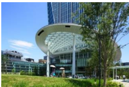
Toranomon Hills Mori Tower Oval Square