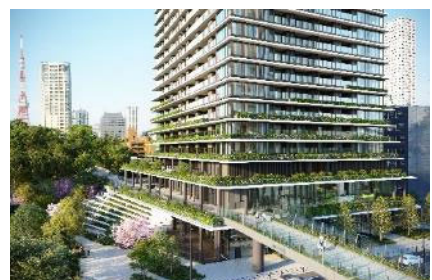
Toranomon Hills Residential Tower