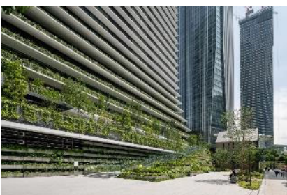
Toranomon Hills Business Tower

Toranomon Hills Mori Tower’s greenery and biodiversity initiatives, which include 6,000 m 2 of landscaped space featuring the Oval Square roof garden, Step Garden and even flowing streams, have received a top AAA certification from the Japan Habitat Evaluation and Certification Program (JHEP) run by the Ecosystem Conservation Society–Japan. The Business Tower boasts the tastefully landscaped 1,200 m 2 Seio Park and the Residential Tower has added extensive greenery throughout the buildings’ lower exterior layers. More broadly, the area’s greenery forms part of a biodiverse green belt joining adjacent Atagoyama and Atago Green Hills. Such attributes have earned the Toranomon Hills area a top-level Platinum precertification in the Neighborhood Development category of Leadership in Energy & Environmental Design (LEED), a global green-building rating system of the U.S. Green Building Council (USGBC).