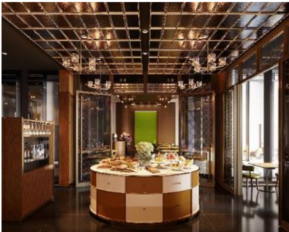
Toranomon Hills Kitchen (1 st floor)