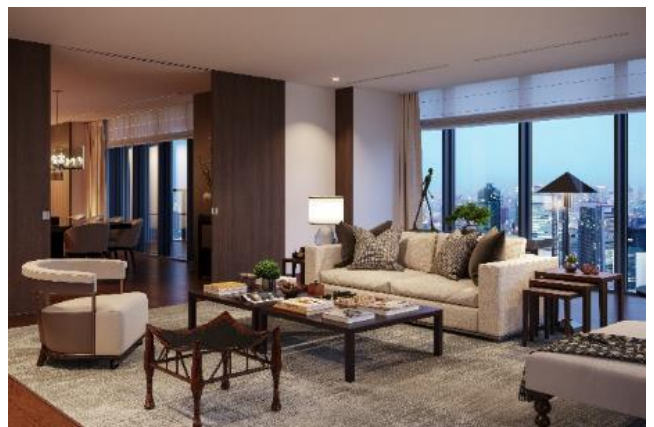
Living Room/Dining Room