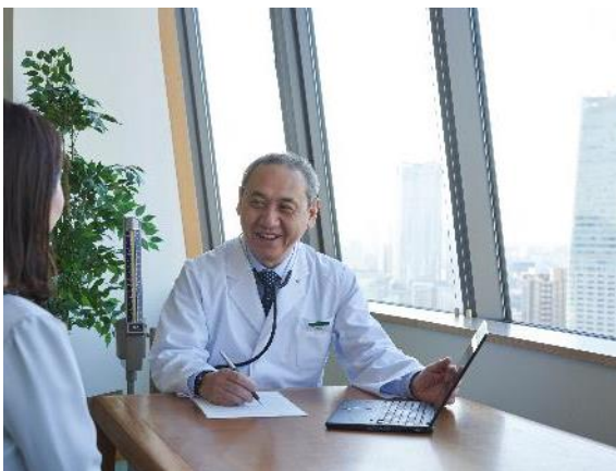
Health clinic (2nd floor, image)