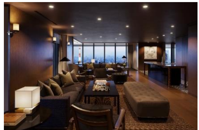
Guesthouse living-dining room (41st floor)