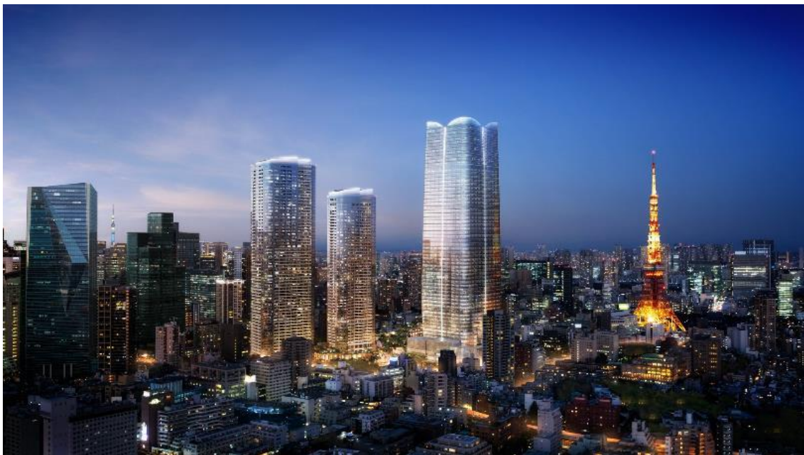
Toranomon-Azabudai Project (image)

Tokyo, February 18, 2021 — Mori Building Co., Ltd., Japan’s leading urban landscape developer, announced today that it will partner with Aman, the operator of diverse world-class luxury hotels and resorts, in the Toranomon-Azabudai Urban Redevelopment Project, a massive urban renewal undertaking that will revitalize a large area of central Tokyo when completed in 2023. The two main outcomes of the partnership will be the branded residence Aman Residences, Tokyo and luxury hotel Janu Tokyo , Aman’s sister brand, marking the debut of the Janu brand in Japan.