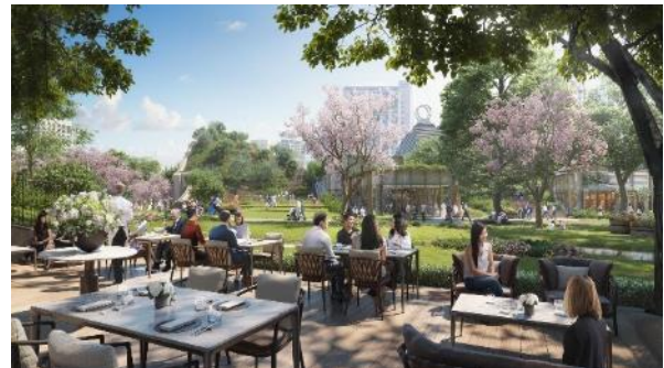
Architecture and landscape design by Heatherwick Studio (image) Hotel restaurant facing the central square (image)