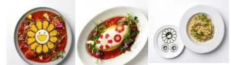
Flower Curry Flower Omelet Rice Flower Pasta