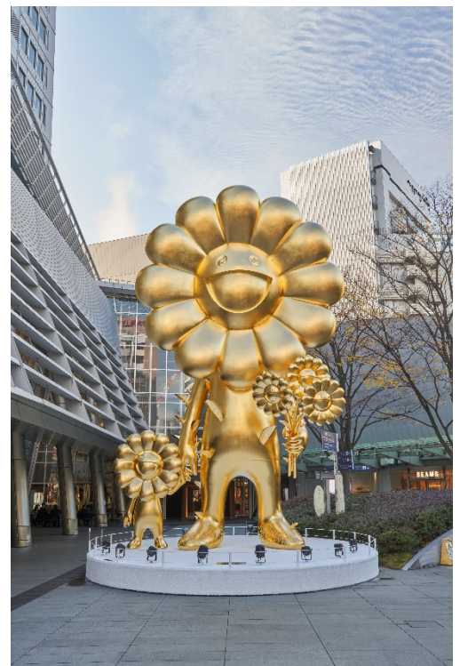
Takashi Murakami Haha Bangla Manus 2020 Material: Bronze and gold leaf Size: 1,000.1cm (H) x 647.1cm (W) x 465.5cm (L) The Bloodstone Public Collection With the cooperation of Kaikai Kiki Co., Ltd.

When I was creating the sculpture, there was a chance that the project would have to be discontinued and our incorporated effort dissolved, which in fact left me greatly distressed, but eventually the funding continued on and my company did not have to be dissolved. The project has finished well, but at that very moment, it was extremely challenging. Most people mistakenly take it that my character and production sites are cheerful and happy because of the smiling characters that appear in my artworks, but creating this dream has also been an anguishing experience. I hope this sculpture is to be completed safely."