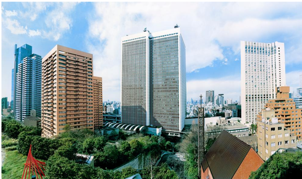
Overview of Ark Hills