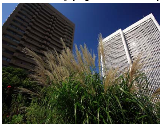
Ark Garden's abundant eulalia