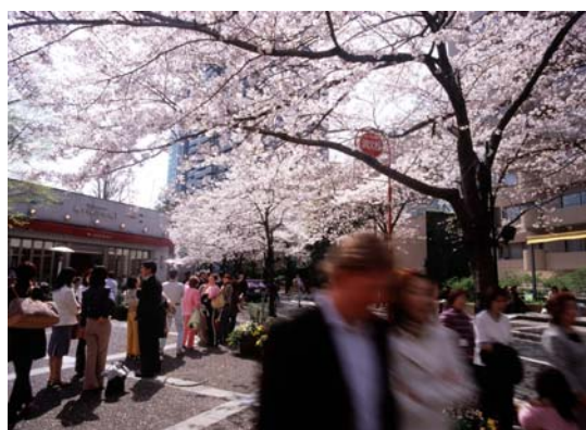
Visitors enjoying the rows of cherry