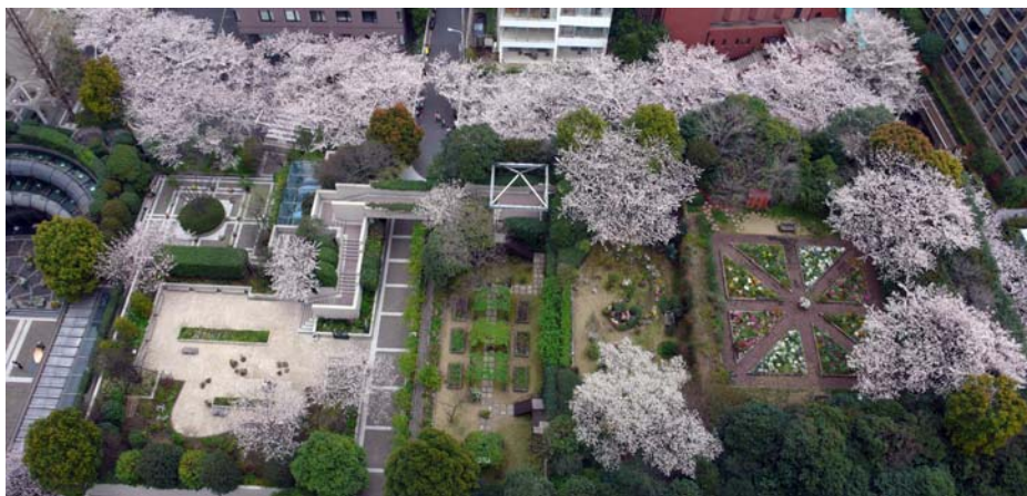
Cherry blossoms in full bloom in Ark Garden

※See page 3 for details of the Energy Globe Award.