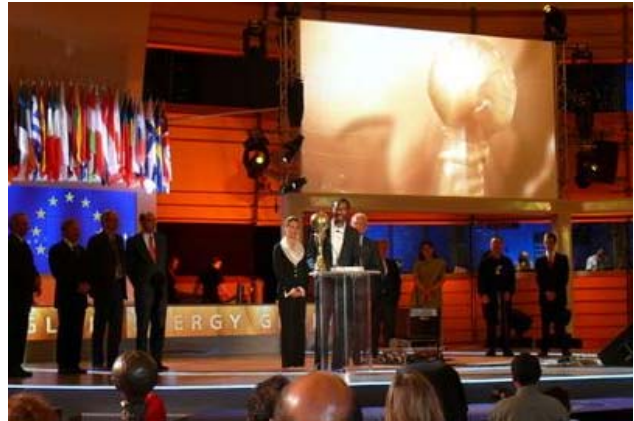
The awards ceremony at the European Parliament