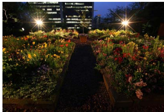
The Roof Garden in spring (night)