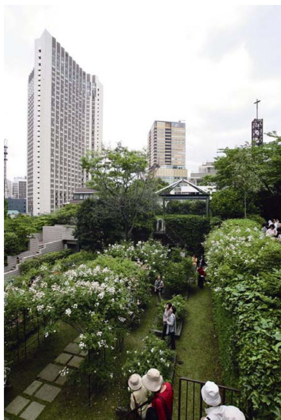
Ark Garden, a garden in the center of the city