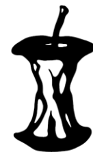
THE CORE KITCHEN/SPACE