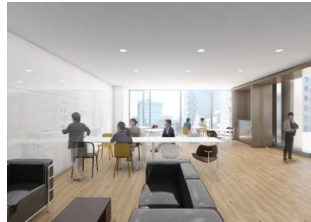
3 rd floor incubator provides small offices, a common lounge and common meeting rooms