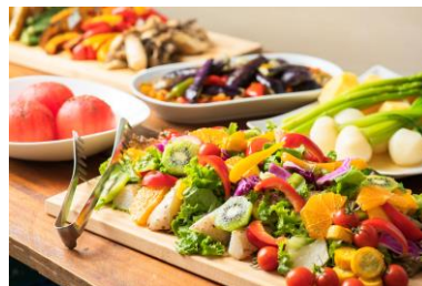
Shunpachi Kitchen & Table