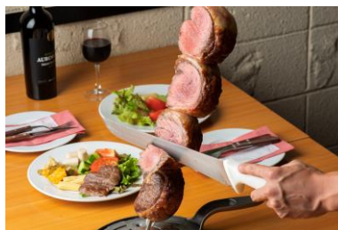
Churrascaria Que bom!