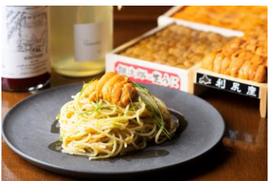
TWO • TWO • TWO