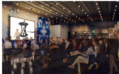
Expected to conduct cutting-edge business events and workshops KITCHEN/SPACE