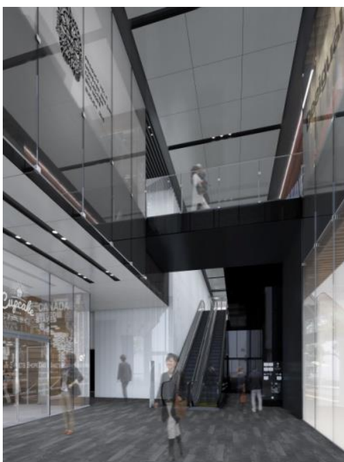
Main entrance with open ceiling

High-spec offices on the 4 th to 14 th floors of SHINTORA-DORI CORE are a standard 860m 2 in size with 2.8m ceiling heights and bright, open floor plans. Eco designing includes LED lighting with sensor-adjusted brightness and solar-power electric generation. A rooftop garden combining relaxing nature with marvelous views of the Tokyo cityscape is provided for the exclusive use of SHINTORA-DORI CORE office tenants. CREEK & RIVER Co., Ltd. and its group companies, which are renting office space in the complex, support creatives and other leading-edge professionals and are expected to contribute to the development of the Shimbashi/Toranomon area.