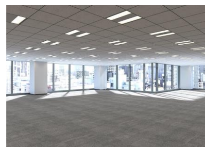
High-spec offices on the 4 th to 14 th floors