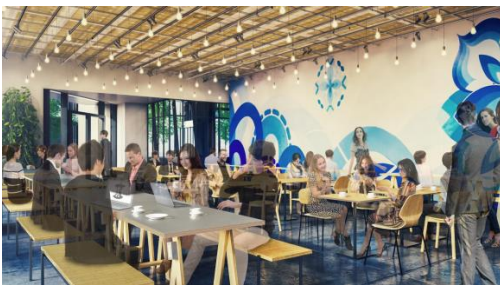
THE CORE KITCHEN/SPACE is a base for area-management activities