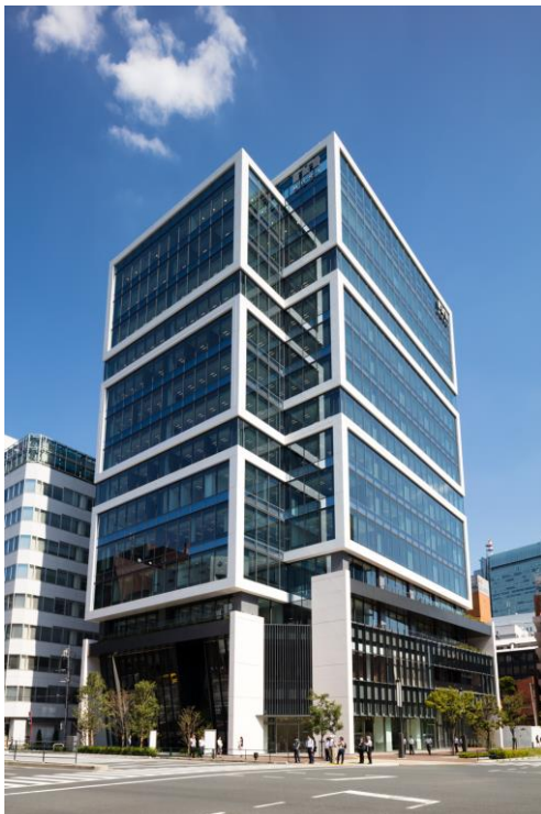
Model project for development along Shintora-dori Avenue

Tokyo, October 18, 2018 — SHINTORA-DORI CORE, a new complex jointly constructed by Mori Building, a leading urban developer in Tokyo and Obayashi-Shinseiwa Real Estate, opened in the Shimbashi 4-chome area of Tokyo. SHINTORA-DORI CORE is the first major project in a master plan calling for integration of separated city blocks and redevelopment along Shintora-dori Avenue, Tokyo's newest iconic street. Located at the intersection of Shintora-dori Avenue and Hibiya Street, the complex has 15 floors above ground and a basement floor encompassing a total floor space of 17,500 square meters and total rental space of 10,000 square meters. It features high-spec offices, incubation offices, highly welcoming restaurants and shops, and an open café/event space that directly faces Shintora-dori Avenue. Going forward, SHINTORA-DORI CORE is expected to catalyze development along Shintora-dori Avenue as a core where diverse people will gather and create new ideas, and serve concurrently as a hub for bold area-management initiatives in the surrounding Shimbashi/Toranomon area.