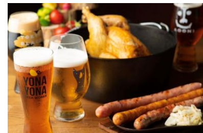
YONA YONA BEER WORKS