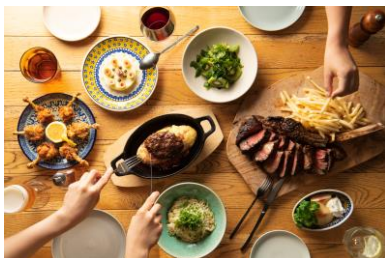
THE CORE KITCHEN/SPACE

Six restaurants and shops, including THE CORE KITCHEN/SPACE , will warmly welcome patrons on the first and second floors. Shunpachi Kitchen & Table , directly operated by a green grocer, will offer lunch boxes at lunchtime and self-serve fresh vegetables and side dishes at night. The Asakusa area's popular Churrascaria Que bom! will operate a moderately price churrasco buffet dinner and YONA YONA BEER WORKS SHINTORA DORI will serve outdoor cuisine and craft beer. The Shimbashi area's popular MIKASA BAR will feature Mediterranean cuisine at MARSALA by MIKASA BAR and TWO • TWO • TWO will proffer organic wine. Each establishment will be uniquely conceived and available for use by everyone, from individuals to large groups, and for diverse occasions including parties, girls' nights, dates and much more.