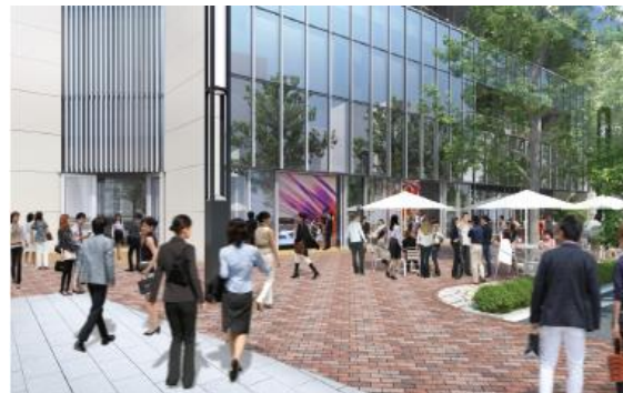
The street-side terrace on Shintora-Dori Avenue enhances unity with the surrounding community

With SHINTORA-DORI CORE serving as a core for the surrounding area, Mori Building is committed to strengthening Tokyo's magnetism by developing Shimbashi/Toranomon area as an international hub and global business center where global players live, work and gather.