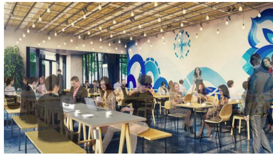
THE CORE KITCHEN/SPACE will become a hub for community development