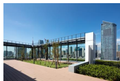
Exclusive roof garden where tenants can enjoy both nature and urban scenery