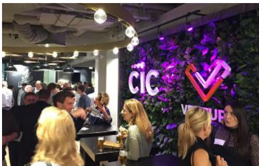
Venture Café, launched by CIC

Tokyo, March 6, 2018 — Mori Building, a leading urban developer in Tokyo, announced today that it is collaborating with Venture Café, an innovation promotion program developed by Cambridge Innovation Center (CIC), the world’s leading builder of innovation hubs, to help expand its global network into Asia. Starting on March 22, Venture Café Tokyo will launch its “Thursday Gathering” weekly program at Toranomom Hills, Mori Building’s newest mixed-use complex in Tokyo.