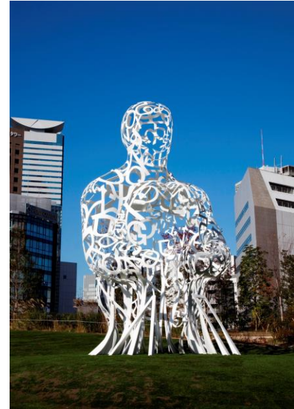
Roots by Jaume Plensa (2014) Stainless steel and paint • 5.5m (W) x 6.5m (D) x 10m

Roots , which measures 5.5m (w) x 10m (h) x 6.5m (d), depicts the form of a seated person. Constructed with letters and characters of eight languages — Arabic, Chinese, Greek, Hebrew, Helvetic, Hindi, Japanese and Russian — the sculpture expresses the universal nature of global culture and the bonds that tie humanity together.