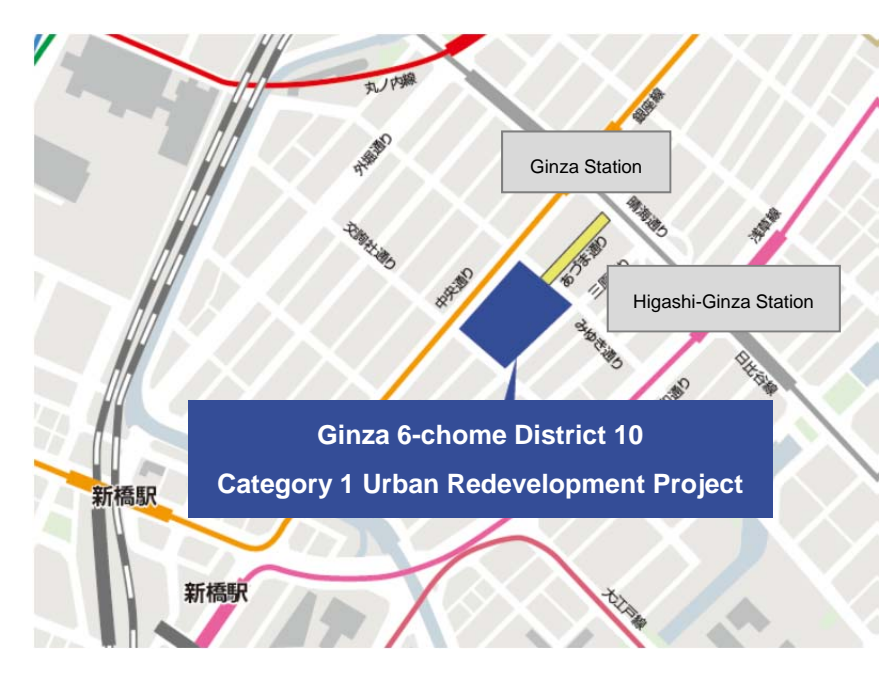
Future plans contained in this press release are subject to change.