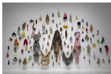
Annette Messager Remains (family ID 2000) "Annette Messager The Messenger" Mori Art Museum Tokyo ADAGP, Paris & JASPAR, Tokyo, 2013© D0199

The first large-scale exhibition in Japan to present one of France's most representative female artists, Annette Messager.