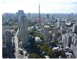
View to the south