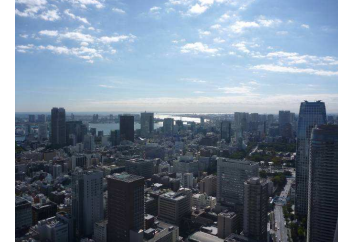
View to the southeast