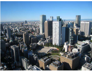
View to the southwest