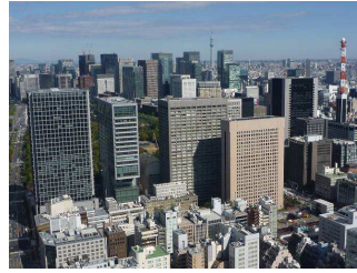
View to the north