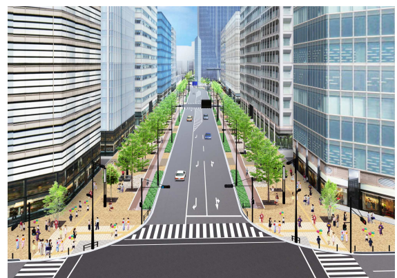
Image of completed project

Sidewalks wider than those on Omotesando Street will be constructed.