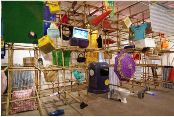
Yukihiro Taguchi “away” 2009/2012 ©yukihiro taguchi courtesy: mujin-to production