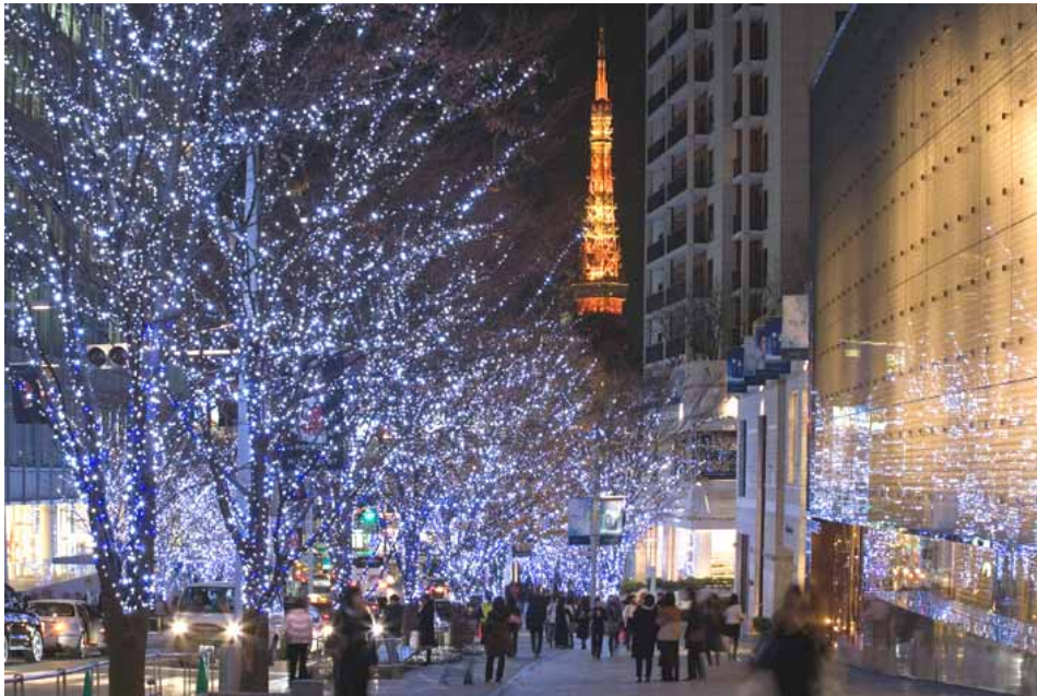
Christmas lights at Roppongi Hills (Roppongi Keyaki-zaka Street)

Green energy is being used for those at Roppongi Hills, Omotesando Hills and ARK Hills. We are participating in the “Green Christmas Festa” of the Ministry of Economy, Trade and Industry and aiming to produce environmentally friendly illuminations.