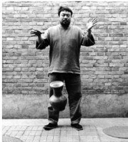
Dropping a Han Dynasty Urn 1995 triptych b/w prints 180×199cm

Ai Weiwei was born in Beijing in 1957 as the son of Ai Qing, one of modern China's most renowned poets. He entered the Beijing Film Academy in 1978. In 1979 and in 1980, Ai took part in exhibitions as a member of "Xingxing (The Stars)," the first avant-garde group in China after the Cultural Revolution. Soon afterwards in 1981, Ai moved to New York, where he spent 12 years until his return to China in 1993. The influence of American contemporary art and European modernism such as the Dada movement and Duchamp is evident in his work of the 80s. After his return to China, alongside his work in publishing, Ai became involved in the founding of the China Art Archive & Warehouse (CAAW) as artistic director, and has since continued to support emerging young Chinese artists. In 2000 Ai curated the "Fuck Off" exhibition in Shanghai. The extreme works that featured in "Fuck Off" were hugely controversial, yet the exhibition itself has become legendary.