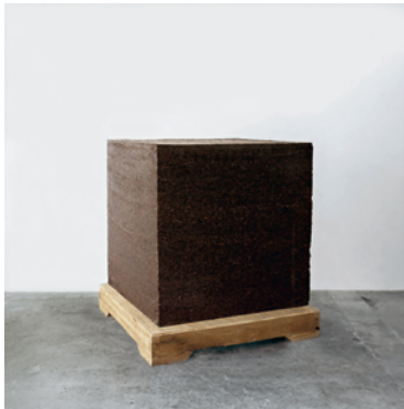
Ton of Tea 2006 1 ton compressed Tea 100 x 100 x 100 cm ©FAKE Studio