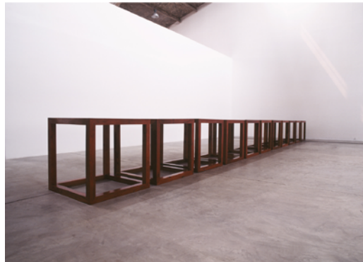
Cubic Meter Tables 2006 huali wood 13 pieces, each 100x100x100cm ©FAKE Studio