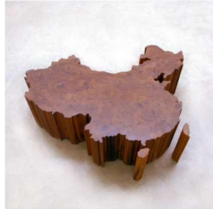
Map of China 2004 Tieli wood from dismantled temples of the Qing Dynasty (1644-1911) h. 51 cm, Ø200 cm

Tel: +81-3-6406-6111 Fax: +81-3-6406-9351 E-mail: pr@mori.art.museum Website: www.mori.art.museum