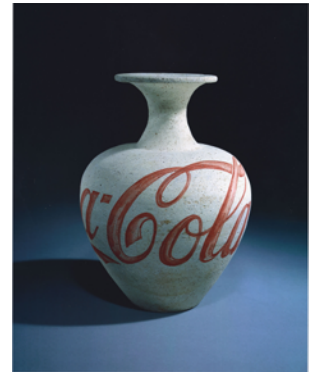
Coca Cola Vase 1997 vase from the Tang Dynasty (618-907) and paint 24 cm, Ø 18 cm ©FAKE Studio