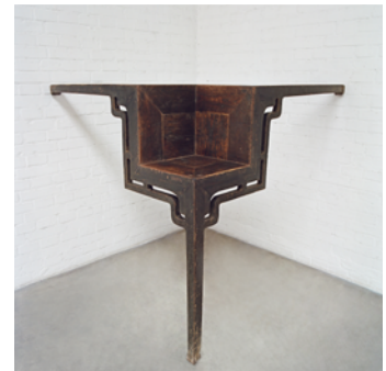
Table with Three Legs 2006 Table from the late Ming or early Qing Dynasty (1368 - 1911) 116 x 155.5 x 155.5 cm

Press Images: Images are available on our website.