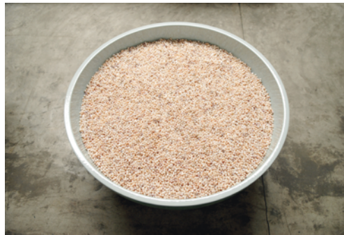
Bowl of Pearls 2006 porcelain, freshwater pearls each h. 43cm, Ø 100 cm ©FAKE Studio