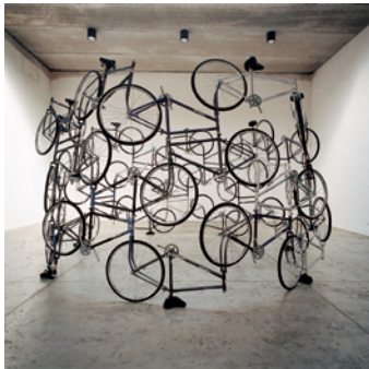
"Forever" 2003 42 bicycles h. 275 cm, Ø 450 cm ©FAKE Studio