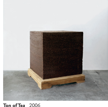
I ton compressed Tea 100 x 100 x 100 cm ©FAKE Studio