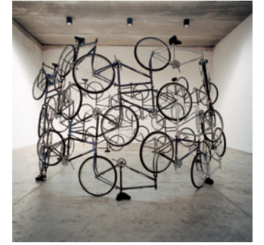
"Forever" Bicycles 2003 42 bicycles h. 275 cm, Ø 450 cm ©FAKE Studio