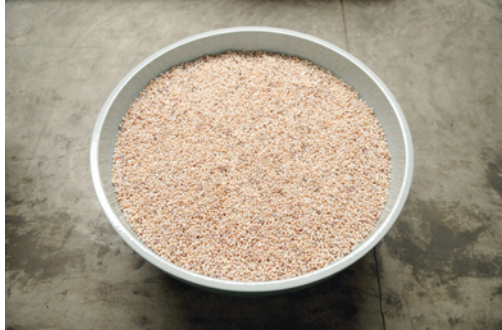
Bowl of Pearls 2006 porcelain, freshwater pearls each h. 43cm, Ø 100 cm ©FAKE Studio