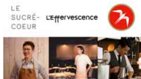
Blouangerie (bakery) and café open in June