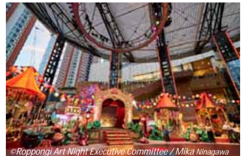
Mika Ninagawa Roppongi Art Night 2017

From May 26 to 27, Roppongi Hills, Mori Art Museum, Suntory Museum of Art, The National Art Center, Tokyo Midtown, Tokyo Metropolitan Government, and other institutions and facilities in the Roppongi area will jointly host the 9 th Roppongi Art Night, a one-night celebration of art. Since 2009, the event has served as a pioneering model for combining urban development and the enjoyment of art in everyday life. Admission is free and the event is available for anyone to join.