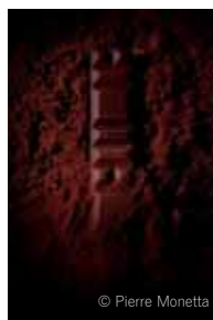
Le Chocolat Alain Ducasse Roppongi opens on April 27