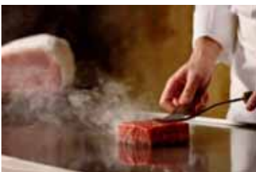
Roppongi Ukai-tei opens on March 29 (2 venues)

Six new establishments run by top culinary artisans will be opened along Roppongi Hills’ Keyaki-zaka street, where many of the world’s best-known luxury brands are on display. Le Chocolat Alain Ducasse Roppongi will launch a flagship chocolat boutique with a salon in April, and Ukai Group will open Ukai-tei , Japan’s top-notch teppan-yaki restaurant, and Kappou ukai in March. New openings in June will include L’Effervescence , which already operates a Michelin two-star French restaurant in Tokyo, Le Sucre-Coeur , a leading French bakery in Osaka, and several other globally renowned restaurants, further enhancing Roppongi Hills’ reputation as a culinary paradise.