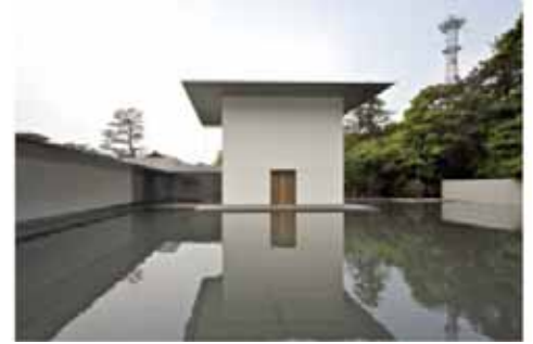
Yoshio Taniguchi and Associates D.T. Suzuki Museum, 2011 Kanazawa, Japan

https://www.mori.art.museum/en/exhibitions/japaninarchitecture/index.html