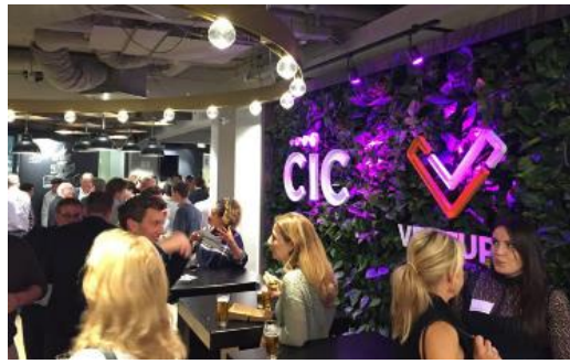
Venture Café, launched by CIC

Tokyo, March 6, 2018 — Mori Building, a leading urban developer in Tokyo, announced today that it is collaborating with Venture Café, an innovation promotion program developed by Cambridge Innovation Center (CIC), the world's leading builder of innovation hubs, to help expand its global network into Asia. Starting on March 22, Venture Café Tokyo will launch its "Thursday Gathering" weekly program at Toranomon Hills, Mori Building's newest mixed-use complex in Tokyo.