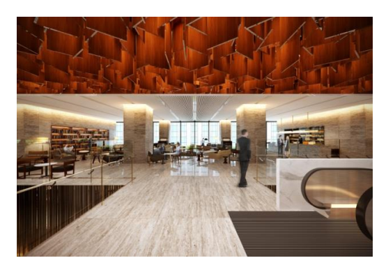
Rendition of Innovation Center

Also, Toranomon Hills Station Tower* will offer a similar facility on its top floor to welcome diverse innovators from large enterprises to small startups, as well as entrepreneurs, investors and members of the general community for innovation and business development.