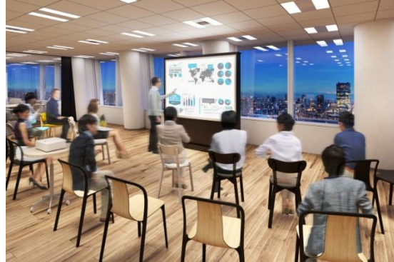
Space can be used for events/seminars