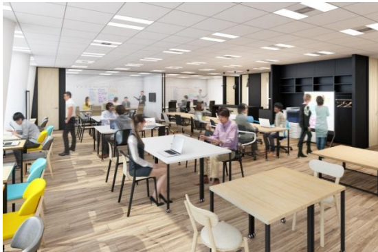
Co-working space (image)

Tokyo, August 9, 2017 — Mori Building, a leading urban developer in Tokyo, today announced that it will open “Ignition Lab MIRAI,” a business incubation center, on the 40 th floor of Atago Green Hills Mori Tower on August 21. The Lab, by facilitating collaboration among next-generation entrepreneurs, is expected to help nurture new business and innovation in Tokyo. In addition, it will serve as a prototype for the Innovation Center, a large-scale business incubation center that will be housed in the Toranomon Hills Business Tower when the tower is completed in 2019.