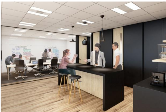
Pantry adjacent to co-working space for refreshments and socializing