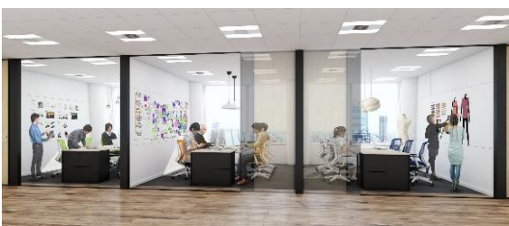
Six furnished project rooms for short-term rent for small incubators (4–10 people)