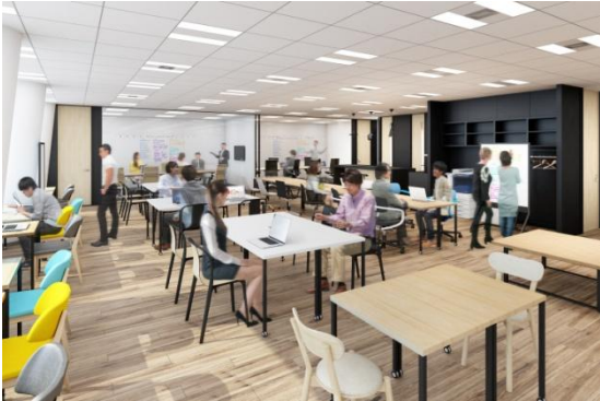
Users can choose various sizes of desks or chairs according to their work style (42 seats)