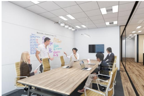
Six meeting rooms, each for 4–8 people, with PC monitors and white boards