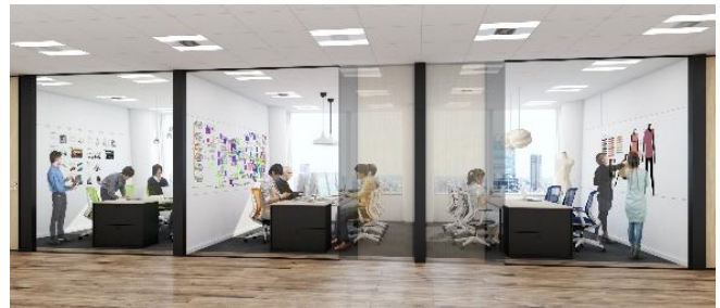
Furnished project rooms (image)

Ignition Lab MIRAI’s 700 square meters will provide offices and furnished project rooms available for short-term rent, as well as co-working spaces and meeting rooms, targeted at agile start-ups seeking temporary offices or meeting hubs for collaboration. Events will be hosted periodically to facilitate dialogue, strengthen the Lab’s community spirit and encourage collaboration among diverse tenants representing broadly varying fields. To date, a number of companies have already applied for spaces.