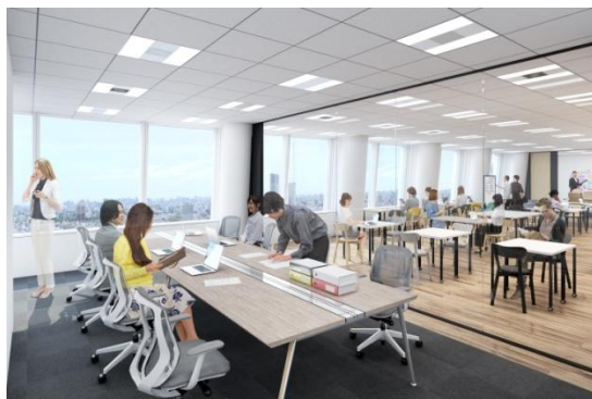
Small offices for large-firm spin-offs

Note: Depicted interiors are subject to change