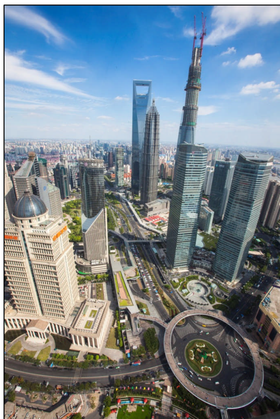
Pedestrian bridge interconnecting Lujiazui area (September 2013)

The completion of the bridge symbolizes Shanghai's dynamic and speedy urban development and can be considered a development example of a vertical garden city proposed by Mori Building.