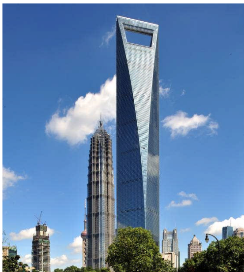
Shanghai World Financial Center

The Shanghai World Financial Center is a "vertical multi-use city" that boasts state-of-the-art offices meeting the needs of global corporations, the highest observation deck in the world (recognized by the Guinness Book of Records as being 474m above ground level), the elite Park Hyatt Hotel, and shopping malls. Since its completion in 2008, the building has attracted information and people from around the world based on the concept of being a "global magnet", generating trends, exerting influence and, unlike conventional international finance centers, maintaining its bustling activity and magnetism as a hub not only for business but also culture and sightseeing. At present, it has nearly filled all its offices (with a 99% utilization rate) and, with more than 8 million visitors to its observation deck over the last five years, has established itself as a landmark of Shanghai.