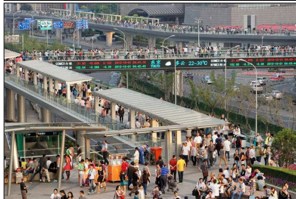
Bustling pedestrian bridge on National Day (October 2013)

Based on the concept of being a "global magnet," the five-year-old Shanghai World Financial Center, a central institution in China's financial opening up to the world, will continue to fulfill its role by leading the growth of Shanghai as an international financial center. With a philosophy of "creating and developing cities," Mori Building Co., Ltd. and Mori Building China (Shanghai) Co., Ltd. will also apply their comprehensive urban development knowhow of city planning and operational management to contribute to attractive urban developments not only in the Lujiazui