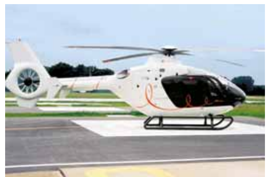
Eurocopter EC135 Hermes Edition

*As a rule, a helicopter flights will be cancelled if no bookings are received.