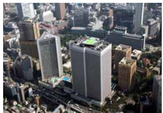
ARK Hills Heliport